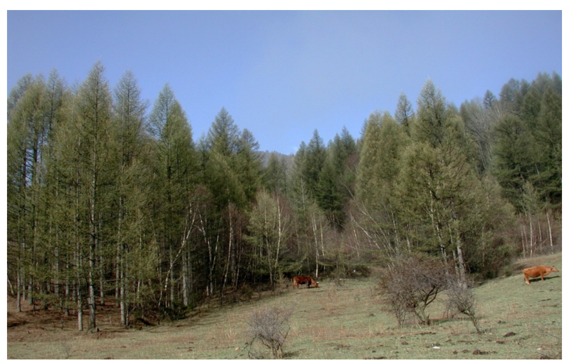
Pangquangou (CN306) is located in the Shanxi Mountains Endemic Bird Area, which includes the mountains of Shanxi and Hebei provinces and is one of the few EBAs in northern latitudes, and it is an important site for Brown Eared-pheasant Crossoptilon mantchuricum .

Key: ● = Protected; ○ = Partially protected; ○ = Unprotected.